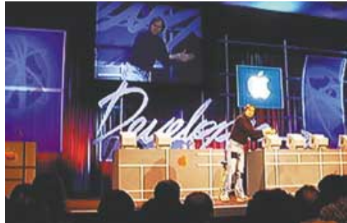
The annual keynote from Apple CEO Steve Jobs is a perennial favourite with attendees at the WorldWide Developers Conference.