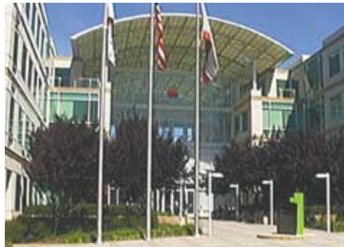
Apple headquarters in Cupertino, California.