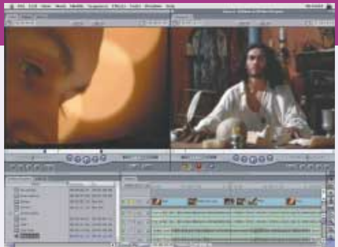
Side-by-side editing provides an integrated control panel for visualising transitions, audio overlays and movie components

Controlling DV camcorders and VCRs and bringing footage into Final Cut Pro couldn't be easier. The program excels in its controls and it worked without a glitch when Panasonic, Sony and Canon