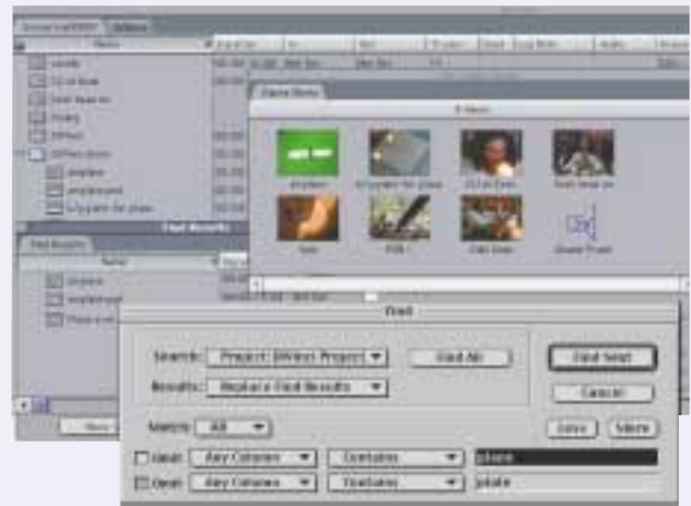
Final Cut Pro makes it easy to organise multimedia content for inclusion in final works

DV equipment was accessed via i.LINK. The DV interface worked without a problem from the very first connection.