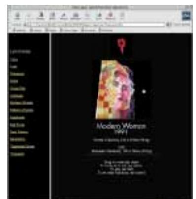
Virtual Art Gallery will allow users to manipulate three-dimensional artwork as if they were walking around it in a real gallery